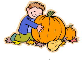
pu m pk in