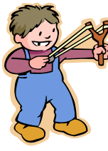
sl ing shot